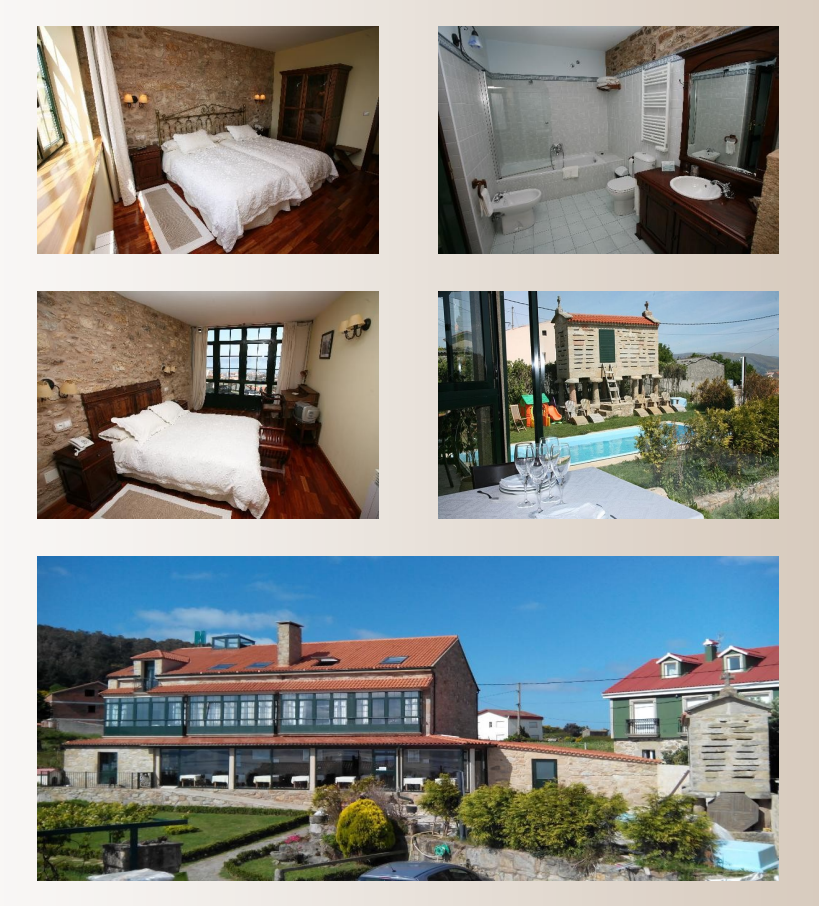
You can book the accommodations in this guide in JUST ONE STEP