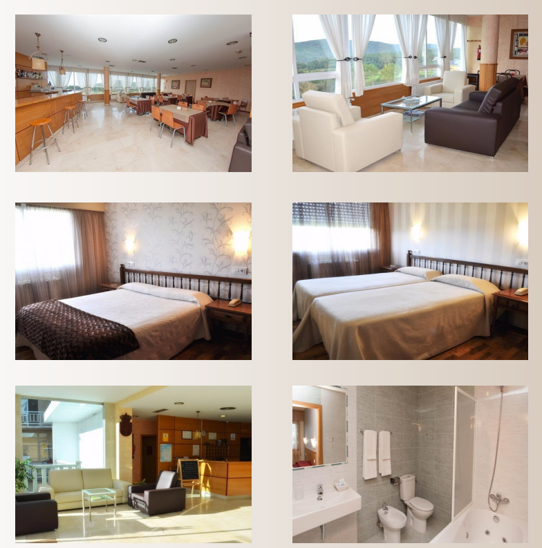
You can book the accommodations in this guide in JUST ONE STEP