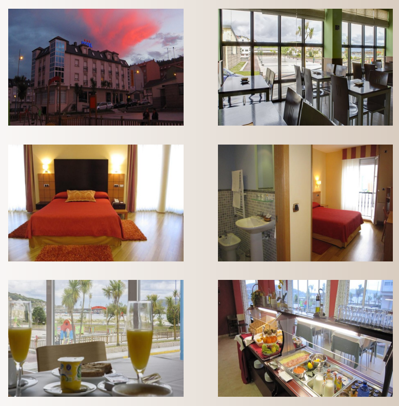
You can book the accommodations in this guide in JUST ONE STEP